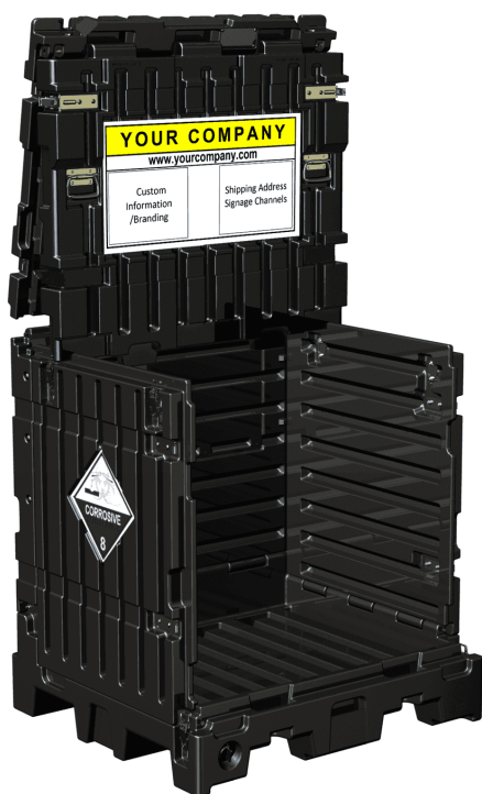
Safe Manual Loading / Unloading

The Dangerous Goods Segregation (DGS) Container is certified as a Type II Segregation Device (ADG Approval No. W008) for the segregation of incompatible Dangerous Goods during transport and storage. The DGS Container is ideally suited for the safe manual loading and unloading of smaller packages or for palletised larger items using a custom drop in pallet.