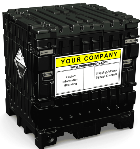
Closed - Ready for Transport