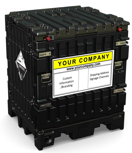
Closed - Ready for Transport