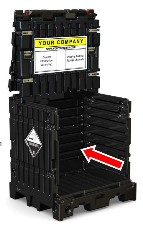
Front Load Configuration