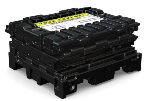
Collapsible & Stacks 4 High