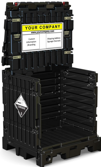
Safe Manual Loading / Unloading

The Dangerous Goods Segregation (DGS) Container is certified as a Type II Segregation Device (ADG Approval No. W008) for the segregation of incompatible Dangerous Goods during transport and storage. The DGS Container is ideally suited for the safe manual loading and unloading of smaller packages or for palletised larger items using a custom drop in pallet.