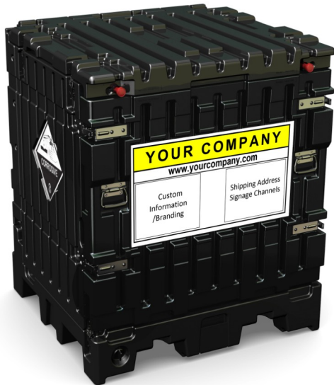
Closed - Ready for Transport